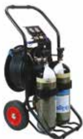
Dräger PAS AirPack 1: Extended duration breathing apparatus at its best.

Where the site has an installed supply of air, the Dräger AF1400 air filter unit can be used to provide clean air, free from dust and particles, with the Dräger PAS AirPack 1 acting as back-up.