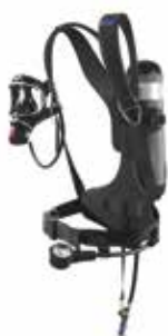
Dräger PAS Micro: A compact, back-mounted life saver.

Developed by Dräger to combine ergonomic design with comfort and ease of use.