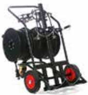
Dräger PAS AirPack 2: Extended duration breathing apparatus at its best.

For additional flexibility, the Dräger PAS AirPack 2 can be supplied with either one or two pressure regulators and two hose reels to allow joint use of the system, or for two completely independent systems to be run simultaneously.