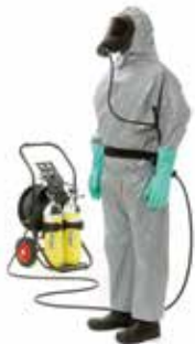
Dräger SPC 3800 Splash Protective Coverall

Light, comfortable, liquid-tight protection.