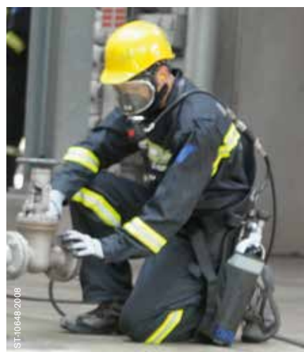
Dräger PAS Colt: This Hip-mounted breathing device is suited to short term operations.