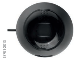
Dräger Interlock® 7000 camera

The control unit of the Interlock 7000 can store up to 10,000 images – if the camera is lost or damaged, all relevant pictures are secure. The images are protected by a special encryption method. The communication between the camera and the Interlock 7000 is also securely encrypted. The images can be read in two ways: via the infrared interface of the Interlock 7000 or, optionally, for high-speed transfer via Bluetooth. The Interlock Manager – the special Dräger software for the Interlock 7000 – is used for this. When the data is downloaded, it is available to authorised persons.