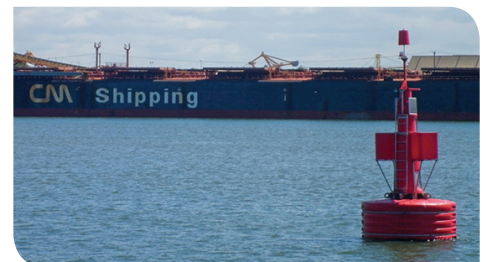
TRIDENT-3000 installation, Port of Newcastle, Australia