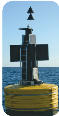
TRIDENT-3000 Damman Port, Saudi Arabia

Sealite buoy products are made from recyclable materials. As a service to customers, individual components and products at the end of their service life may be returned to Sealite for recycling.