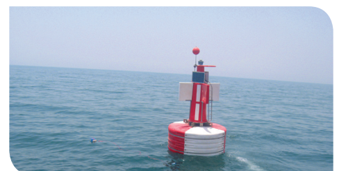
TRIDENT-3000 installation, Middle East