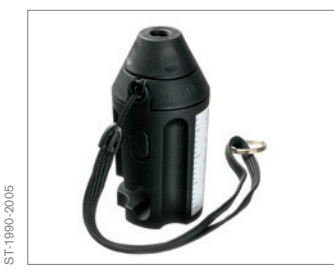
Dräger TO 7000 For safe and easy opening of your Dräger-Tubes

Freezing temperatures down to -20 °C (-4 °F) are no problem for the "tube warmer", which requires no electrical power supply. The Dräger Hot-Pack Holder allows Dräger-Tubes to be used even at ambient temperatures below the limits stated in the instructions for use. Extremely cost effective (the tube warmers can be used several hundred times) and easy to use, the Dräger Hot-Pack Holder is the ideal companion when working at below freezing temperatures.