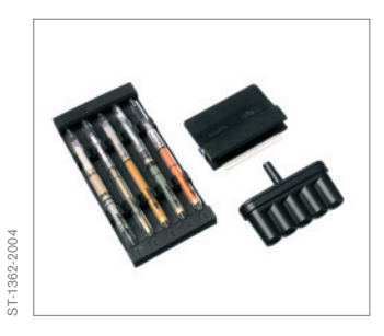
Dräger Simultaneous Test Set Parallel measurement of five gases

We are happy to advise and assist you with working out specific measurement strategies and putting together individual Simultaneous Test Sets to suit your needs.