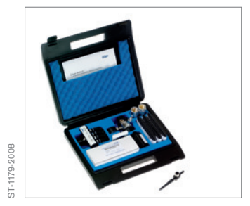
Dräger Aerotest systems

Dräger Safety has developed a range of measurement systems to meet the requirements of your different applications, and put them together as complete sets. The Dräger-Tube kits deliver fast and efficient results.