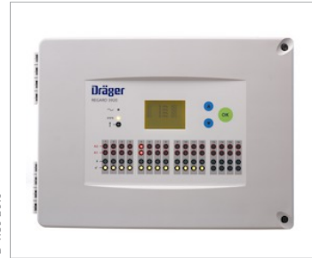
Dräger REGARD® 3910