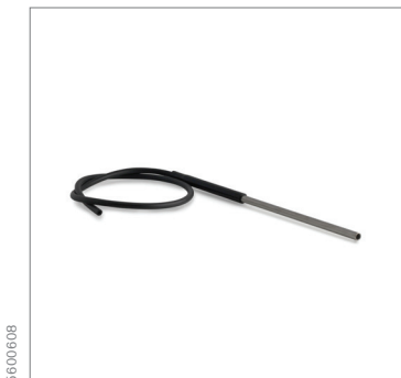
Aluminium gas probe Incl. Taper, 0.7 m hose (up to 200°C)