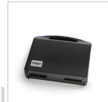
MSI IR3 Infrared Printer