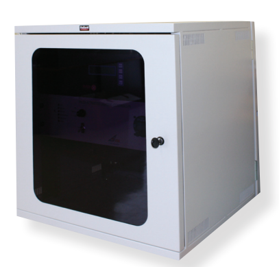
The AV-PALC may be rack mounted within Avlite's optional secure housing or fitted to existing systems

Once the system is activated, the countdown begins after which the lights will automatically turn off, with the length of the countdown being user configurable.