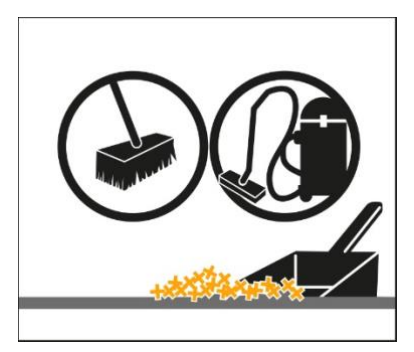
The contaminated OILEX can be swept up or it can be collected with an industrial vacuum cleaner shortly afterwards – the grip of the surface is restored immediately.