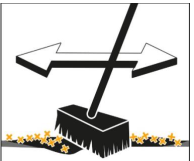
Brush OILEX in with a broom – the spilled/leaked substance will be absorbed immediately.

Remark: Apply OILEX close to the ground.