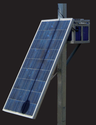
Solar module/battery configuration of AV-09-4WL Windsock Light

The AV-09-4WL can be installed immediately and requires no costly underground wiring. The complete kit comes packaged in a 155x69x76cm pallet for ease of shipping. Other configurations are available on request.