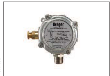
Dräger Polytron SE Ex HT M DD

The sensing head Polytron SE Ex HT M DD (HT = High Temperature) is intended to be used at ambient temperatures up to 150 °C. This sensing head is preferably used in applications where extremely high temperatures can occur, especially for leak detection in the direct vicinity of gas turbines. The temperature resistant terminals are housed in a robust galvanized cast iron enclosure.