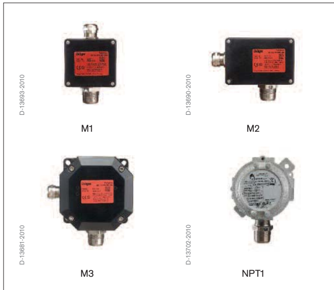
Dräger Polytron SE Ex PR ... DD