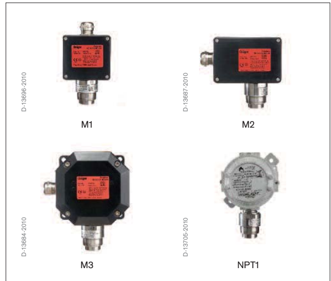
Dräger Polytron SE Ex LC ... DD